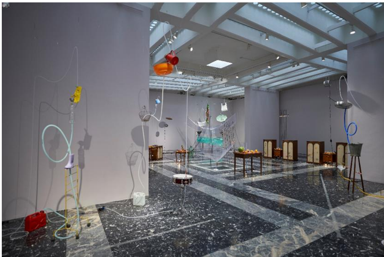
“Yuko Mohri: Compose”, 2024. Installation, Japan Pavilion at the 60th International Art Exhibition – La Biennale di Venezia (commissioner: The Japan Foundation).

July 24 (Fri.) – November 23 (Mon. / nat. hol.), 2026