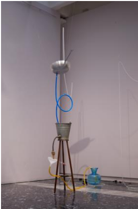
Moré Moré [Leaky]

This sculpture series is inspired by the chronic water leaks throughout Tokyo's subway stations and the makeshift repairs station staff improvise with whatever tools come to hand. A remarkable variety of everyday objects come together as impromptu systems of water circulation.