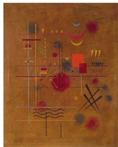
Wassily KANDINSKY, Red in Nets , 1927, oil on cardboard, 61.0×49.0cm

Wassily KANDINSKY, Salvador DALÍ, Pablo PICASSO, Constantin BRANCUSI, NARA Yoshitomo