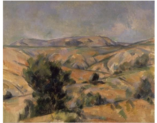
Paul CÉZANNE, Mont Sainte-Victoire Seen from Gardanne , 1892-95, oil on canvas, 73.0×92.0cm

In addition, as the second installment of the Opening Dialogues program launched in fiscal 2025, the collection exhibition includes Kamata Yusuke: A Vision for the Two Landscapes .