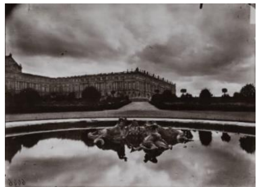
Eugène ATGET, Versailles, "Effet d'Orage" , 1903 (printed in 1977), gelatin silver print, 17.7×23.6cm