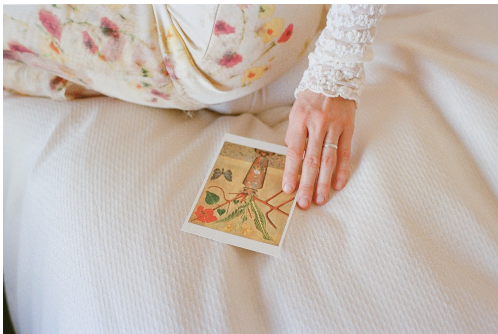
TODA Sayaka, Blooms in Silence , 2025, chromogenic print, Collection of the Artist

June 28 (Sat.) – November 3 (Mon., nat. hol.), 2025