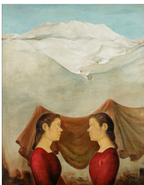
OGAWARA Shu, Dialogue of Twins , 1940, oil on canvas, Yokohama Museum of Art