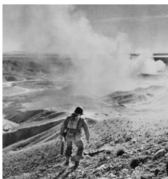
Robert CAPA, El Guettar, Tunisia , March 1943 (reprinted in 1985), gelatin silver print, 27.0×25.4 cm