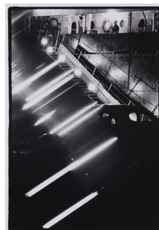
NARAHARA Ikko, Blue Yokohama , 1959 (printed in 1994), gelatin silver print, 31.0×21.3 cm, Gift of Narahara Ikko Archives © NARAHARA IKKO ARCHIVES