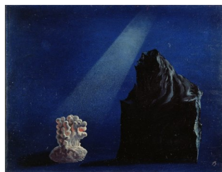
KITAWAKI Noboru, For the Sleepless Night (Study) , 1937, oil on canvas, 40.9×53.0 cm