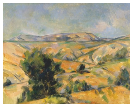
Paul CÉZANNE, Mont Sainte-Victoire Seen from Gardanne , 1892-95, oil on canvas, 73.0×92.0 cm