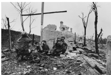
SAWADA Kyoichi, Cross, Tet Offensive, Hue , February 15, 1968 (reprinted in 1986), gelatin silver print, 21.8×32.4 cm