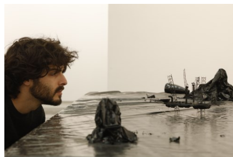
IWASAKI Takahiro, Out of Disorder (Offshore Model) 2017, plastic sheet, disposable bento box, straw, rubber band, plastic bottle, table, 88.5×250×100 cm Long-term loan from a private collection The 57th International Art Exhibition La Biennale di Venezia, Japan Pavilion. Photo by Keizo Kioku ©Takahiro Iwasaki Courtesy of Japan Foundation