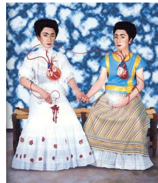
MORIMURA Yasumasa, An Inner Dialogue with Frida Kahlo (Dialogue with Myself I) 2001, chromogenic print, 195×175 cm Long-term loan