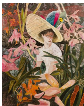
Hernan BAS, His is the only known species to mimic a flower 2017, acrylic paint, enamel on linen 152.8×123 cm Long-term loan