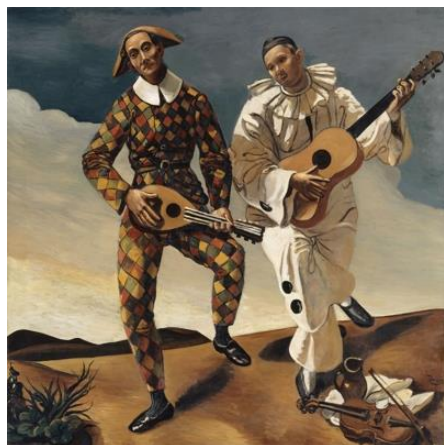
André DERAÏN, Harlequin and Pierrot , ca. 1924, Oil on canvas, 175.0 x 175.0 cm, Photo © RMN-Grand Palais (musée de l'Orangerie) / Hervé Lewandowski / distributed by AMF