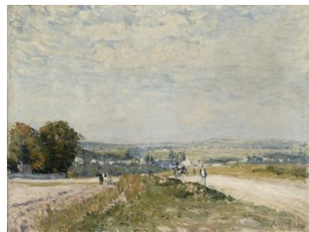
Alfred SISLEY, The Road to Montbuisson at Louveciennes , 1875, Oil on canvas, 46.0 x 61.0 cm