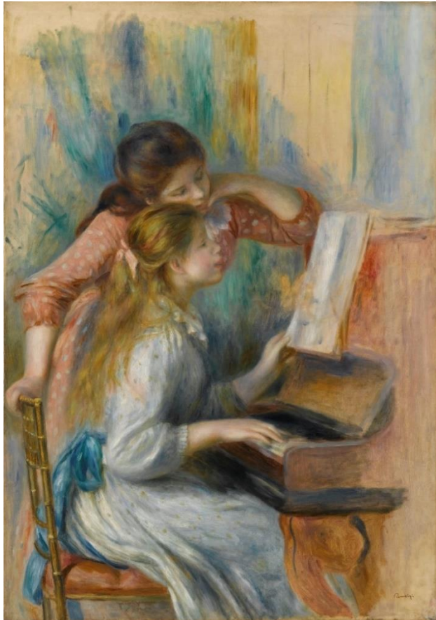
Auguste RENOIR Young Girls at the Piano , ca. 1892, Oil on canvas, 116.0 x 81.0 cm

In celebration of its 30th Anniversary, the Yokohama Museum of Art is presenting Masterpieces from the Musée de l'Orangerie, Jean Walter and Paul Guillaume Collection .