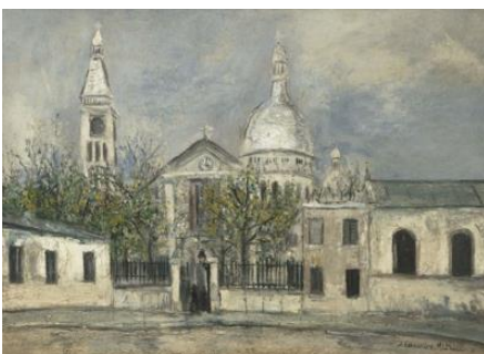
Maurice UTRILLO, Saint Peter's Church, Montmartre , 1914, Oil on card, 76.0 x 105.0 cm