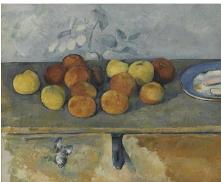
Paul CÉZANNE, Apples and Biscuits, ca. 1879-1880, Oil on canvas, 45.0 x 55.0 cm