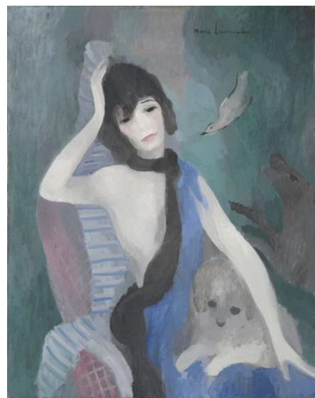
Marie LAURENCIN, Portrait of Mademoiselle Chanel , 1923, Oil on canvas, 92.0 x 73.0 cm, Photo © RMN-Grand Palais (musée de l'Orangerie) / Hervé Lewandowski / distributed by AMF