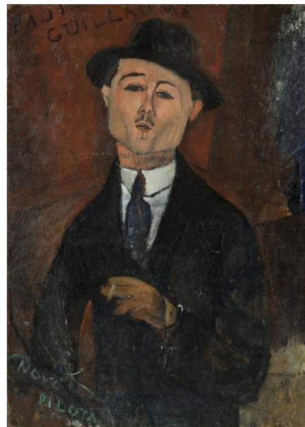
Amedeo MODIGLIANI, Paul Guillaume, Novo Pilota , 1915 Oil on card glued on plywood, 105.0 x 75.0 cm