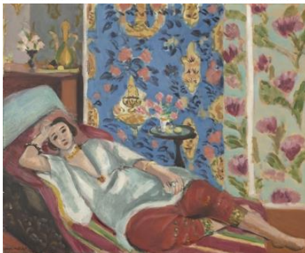
Henri MATISSE, Odalisque with Red Trousers , ca. 1924-25, Oil on canvas, 50.0 x 61.0 cm, Artwork © Succession H. Matisse