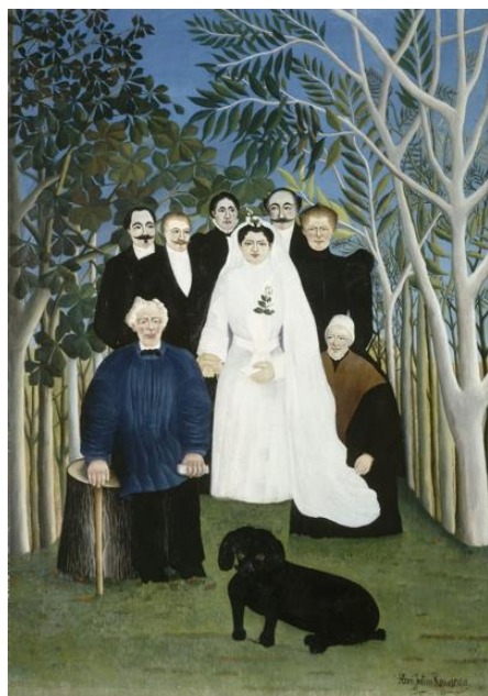
Henri ROUSSEAU, The Wedding Party , ca. 1905, Oil on canvas, 163.0 x 114.0 cm, Photo © RMN-Grand Palais (musée de l'Orangerie) / Hervé Lewandowski / distributed by AMF