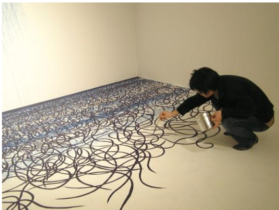
Wall of the Sea, (Production scene at Yokohama Museum of Art, 2006)

His recent major exhibitions include "Quest for Vision Vol.2: Ishida Takashi and Genealogy of Abstract Animation" at the Tokyo Metropolitan Museum of Photography in 2009, "MOT Collection Silent Narrator: On Plural Stories Special Feature: Takashi Ishida" at the Museum of Contemporary Art Tokyo in 2011 and "Double Vision: Contemporary Art from Japan" at the Moscow Museum of Modern Art in 2012, "Image and Illusion: Video Works from the Yokohama Museum of Art" at the Singapore Art Museum in 2014.