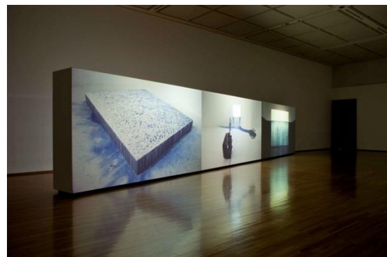
Wall of the Sea 2007, Video (Installation view at Museum of Contemporary Art Tokyo, 2011) ©Takashi Ishida