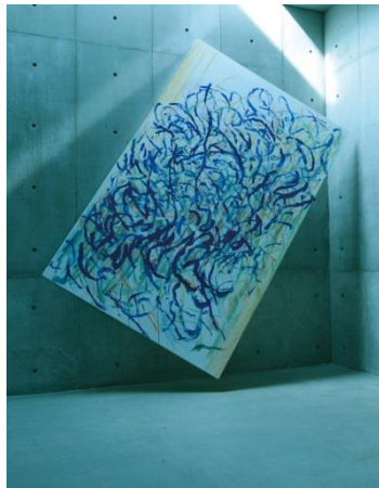
Where Light Falls, 2015, Video ©Takashi Ishida