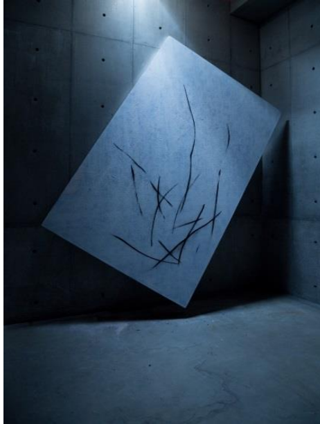
Where Light Falls 2015, Video

March 28 – May 31, 2015 Yokohama Museum of Art