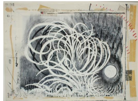
The Art of Fugue 2001, Ink and pencil on paper ©Takashi Ishida

Organizers: Yokohama Museum of Art, THE YOMIURI SHIMBUN