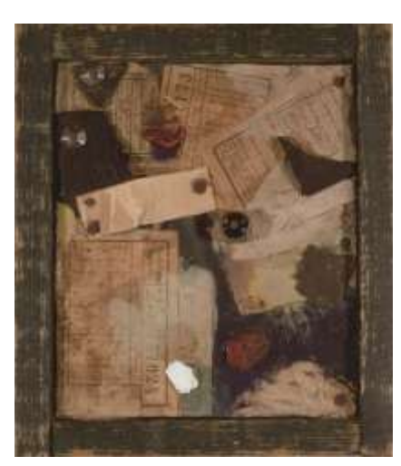
Kurt SCHWITTERS Merzpainting 1C The Doublepicture 1920, assemblage, oil on cardboard, wood, 15.6×13.7cm