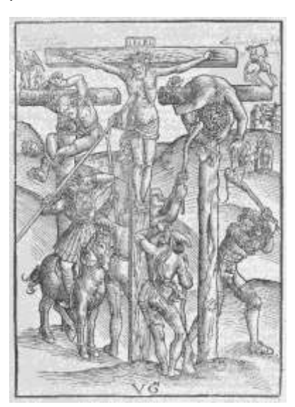
Urs GRAF Crucifixion with Longinus ca. 1506, woodcut, 21.8×15.5cm

This exhibition also offers an opportunity to view rarely displayed 16<sup>th</sup> to the 19<sup>th</sup> century prints from the former collection of author, mountaineer, and Yokohama resident Kojima Usui.