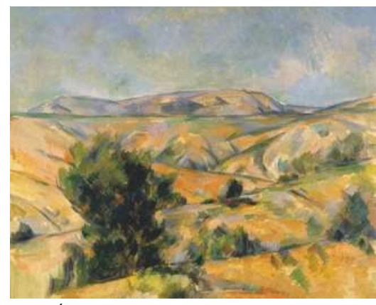
Paul CÉZANNE Mont Saint-Victoire Seen from Gardanne 1892-95, oil on canvas, 73.0×92.0cm

Works by Western artists in the Museum collection number around 1000, including oil paintings, watercolors, prints and sculptures. The collection is distinguished by Surrealist paintings such as Salvador Dalí's Geodesical Portrait of Gala and Rene Magritte's The Museum of the King , Dada and Constructivist works