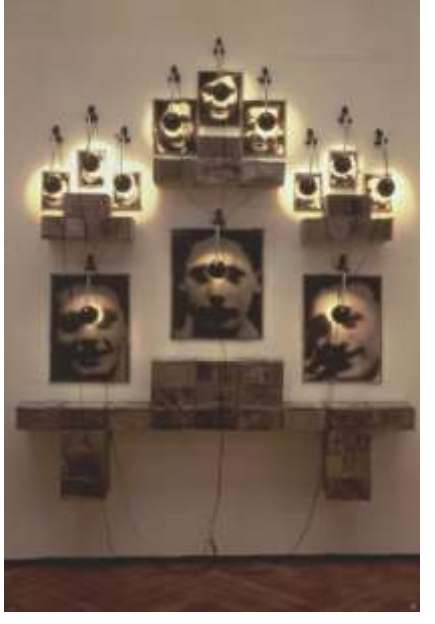
Christian BOLTANSKI Altar to the Chases High School 1987, photographs, steel box for biscuits, lamp, electric wire, 245.0×210.0×d23.0cm ©ADAGP, Paris & JASPAR, Tokyo, 2019 C3129