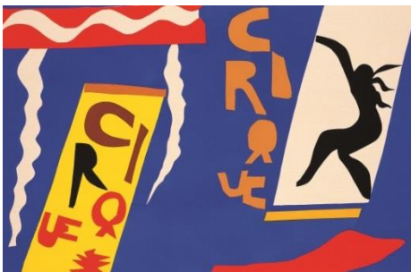
Henri MATISSE (1869-1954) "Cirque", from JAZZ , 1947 Fuji Xerox Print Collection