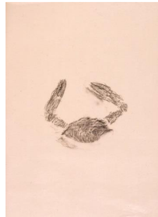
KAWAGUCHI Tatsuo (born in 1940) From Relation—Time Frottage of Time , 1998 Fuji Xerox Print Collection ©Tatsuo Kawaguchi