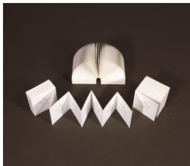
TOMURA Hiroshi (born in 1938) Number of Stars Book A, B , 2005 Fuji Xerox Print Collection ©Tomura Hiroshi