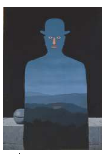
René MAGRITTE The Museum of the King, 1966 Oil on canvas Yokohama Museum of Art