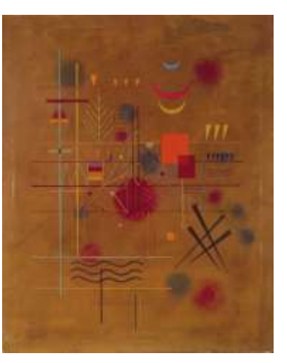
Wassily KANDINSKY Red in Nets, 1927 Oil on cardboard Yokohama Museum of Art