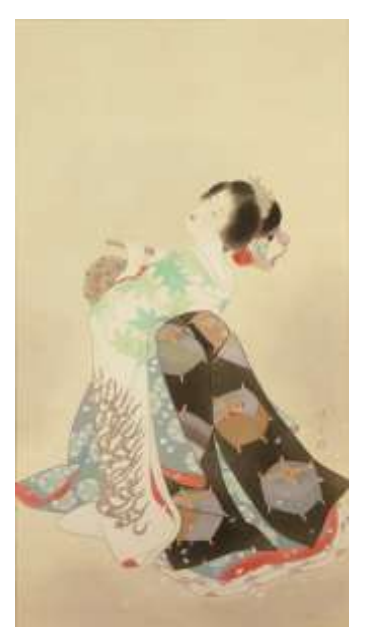
KABURAKI Kiyokata From the Tale of "Kiyohime," 1951 Color on silk Yokohama Museum of Art