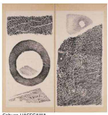
Saburo HASEGAWA, Nature, 1953, two-panel folding screen, ink on paper, each 135.0×66.5cm, The National Museum of Modern Art, Kyoto

Isamu NOGUCHI, Face Dish, 1952, ceramic, 30.8×27.3×2.9cm, The Isamu Noguchi Foundation and Garden Museum, New York ©The Isamu Noguchi Foundation and Garden Museum, New York/ARS-JASPAR Photo: Kevin Noble