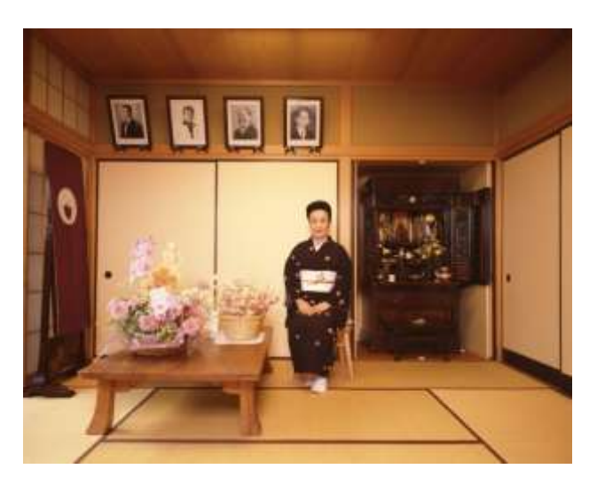
Hibari Misora 1989