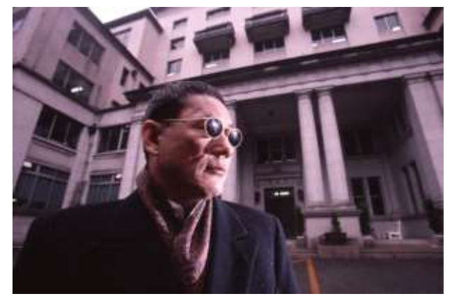
Takeshi Kitano 1998