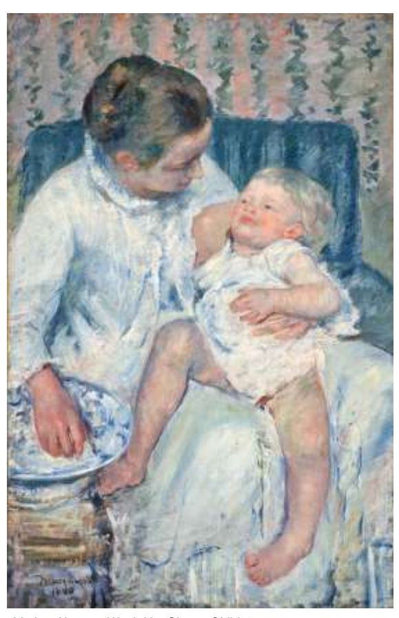
The Yokohama Museum of Art is proud to present the American-born woman artist exhibition Mary Cassatt Retrospective. The exhibition will be open from June 25 to September 11, 2016.

June 25 (Sat) - September 11 (Sun), 2016 Dates: