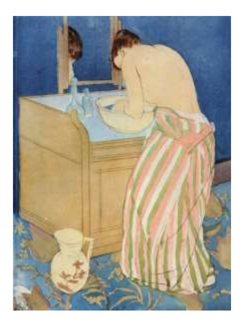
Woman Bathing, 1890-91 Bryn Mawr College