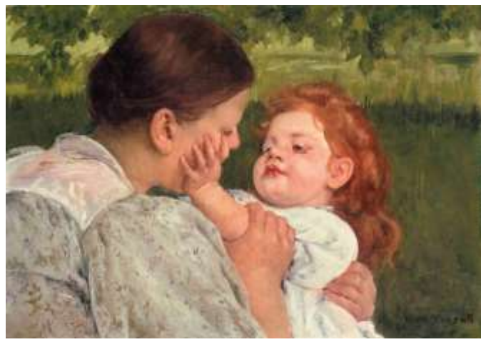
Maternal Caress, 1896 c. Philadelphia Museum of Art

such as Edgar Degas and Berthe Morisot, and will examine their relationship with Cassatt. Furthermore, the exhibition will display the Byōbu-e (folding screen) formerly belonging to Cassatt and also Ukiyo-e prints which influenced the artist, and will analyze in depth what Cassatt mastered from Japanese art.