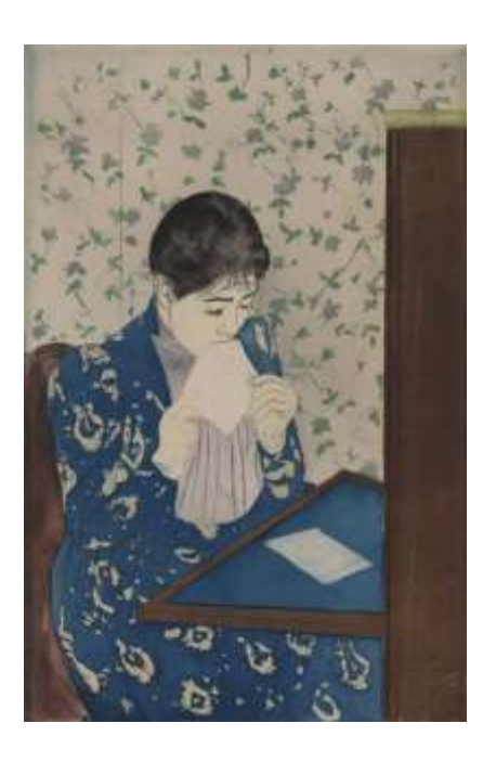
The Letter, 1890-91 Library of Congress Photo: Image courtesy of the Prints & Photographs Division, Library of Congress