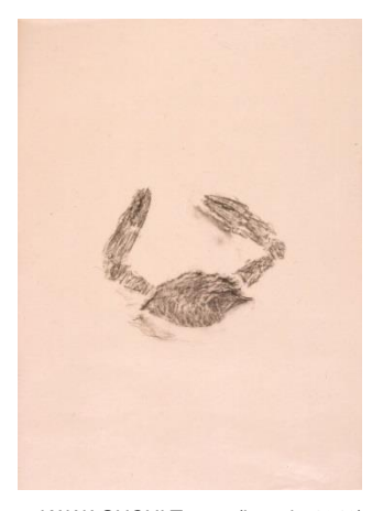
KAWAGUCHI Tatsuo (born in 1940) From Relation - Time Frottage of Time, 1998 Fuji Xerox Print Collection ©Tatsuo Kawaguchi