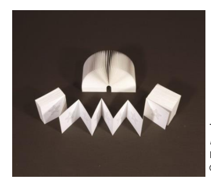
TOMURA Hiroshi (born in 1938) Number of Stars Book A, B, 2005 Fuii Xerox Print Collection ©Tomura Hiroshi