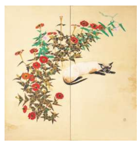
Flowers and Cat, 1934, Private collection (Former collection of Osaragi Jiro)