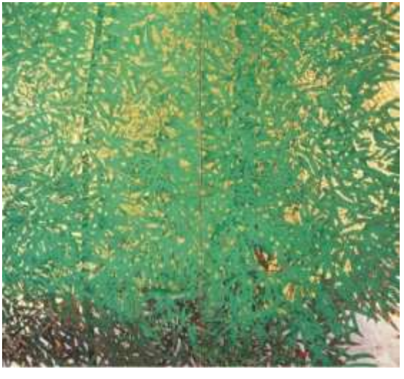
Bamboo Breeze, 1975, Yokohama Museum of Art