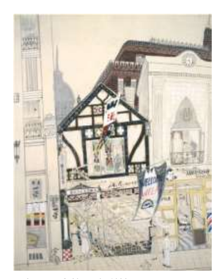
Street of Ginza A, 1936, Yokohama Museum of Art (Donated by the artist)

TEL:+81(0)45 221 0319 FAX:+81(0)45 221 0317 E-mail:pr-yma@yaf.or.jp