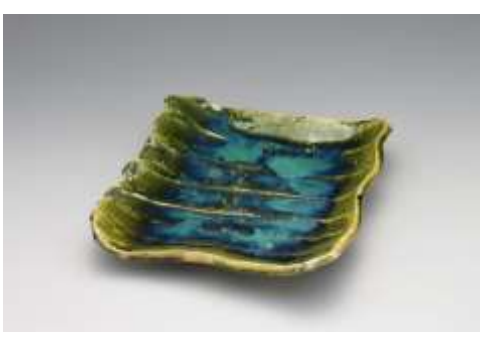
Kita<br/>ōji, Rosanjin, Square\ tray,\ Oribe\ type Showa period