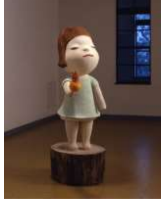
Yoshitomo Nara, Light My Fire, 2001 ©Yoshitomo Nara, Courtesy of the artist