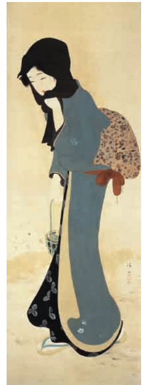
Kaburaki Kiyokata, Seven Spring Herbs , c.1918, 139×48cm, Color on silk, Yokohama Museum of Art