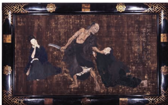
Utagawa Kuniyoshi (Ichiyūsai), Votive Picture of a Lonely House (Hitotsutuya) , 1855, 228.2×372.0cm Color on wood, framed, Sensō-ji