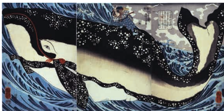
Utagawa Kuniyoshi (Ichiyūsai), Miyamoto Musashi Kills an Enormous Whale , C.1847, Ōban format, triptych, Woodblock print *exhibited from Dec.7