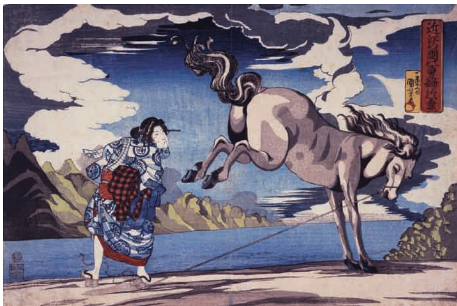
Utagawa Kuniyoshi (Ichiyūsai), Brave Woman, Okane in Ōmi Province (Ōmi no kuni no yūfu Okane) , C.1831-32, Horizontal ōban format, Woodblock print *exhibited until Dec.5

Featuring the most prominent ukiyoe painter in the late Edo period, Utagawa Kuniyoshi (1797-1861), as the originator, this exhibition presents how his innovative forms of expression were inherited and further developed by his disciples and other painters. This will be explored through showing Japanese-style paintings, oil paintings, watercolors, prints, and published books, created between the late Edo and Early Showa period. It will trace a wide range of expressions in the lineage of Kuniyoshi, with the central axis on the styles of Tsukioka Yoshitoshi, Mizuno Toshikata, Kaburaki Kiyokata, and Ito Shinsui. A total of 250 works will be shown (partly replaced in the second half), sectioned into four chapters.